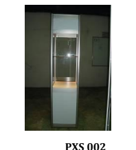
PXS 002 Tall Showcase