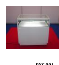
PXC 001 Table Showcase