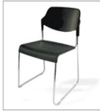
U-C 121 PLASTIC CHAIR (500X420X770 MM.)