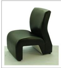
U-S 126 SOFA (530X750X770 MM.)