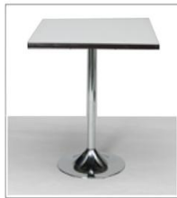
U-T 113A SQUARE TABLE (750X750X750 MM.)