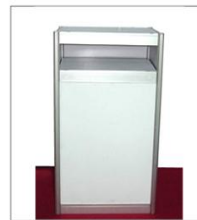
P-A 005 TV & VDO STAND (500X750X1200 MM.)