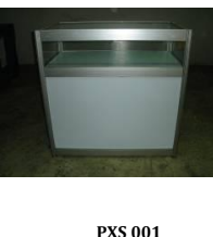
PXS 001 Table Showcase