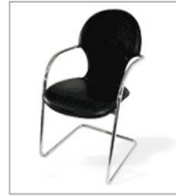
U-C 123 EASY ARM CHAIR (540X600X880 MM.)