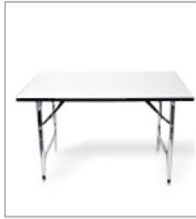
U-T112A RECTANGULAR TABLE (500X1800X750 MM.)