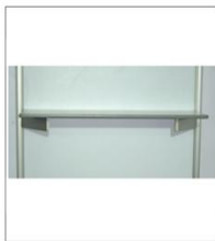
P-A 002 FLAT SHELF (390X950 MM.)