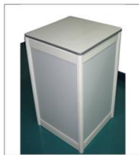
P-A 004 DISPLAY CUBE (500X500X750 MM.)