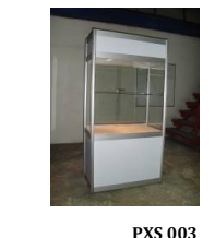
PXS 003 Big Tall Showcase