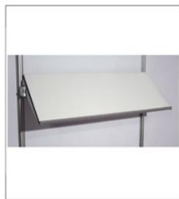
P-A 003 SLOPE SHELF (390X950 MM.)