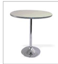
U-T 114A ROUND TABLE (750X750(H) MM.)