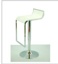
U-C 132N BAR STOOL (360X400X770 MM.)