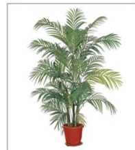
POTTED PLANT (1200 MM.)