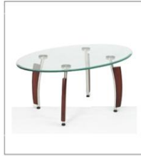
U-T 116 COFFEE TABLE (650X1050X430 MM.)