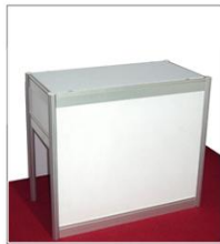
P-T 001 INFORMATION COUNTER (500X1000X800 MM.)