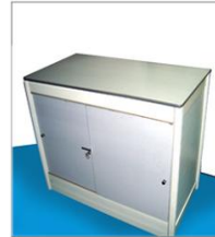
P-A 001 LOCKABLE CABINET (500X1000X800 MM.)