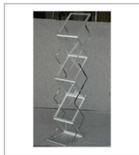
U-A 036 BROCHURE STAND (270X350X1500 MM.)