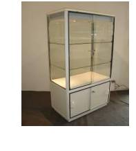
PXC 003 Big Tall Showcase