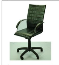
U-C-136 SECRETARY CHAIR (580X450X910 MM.)